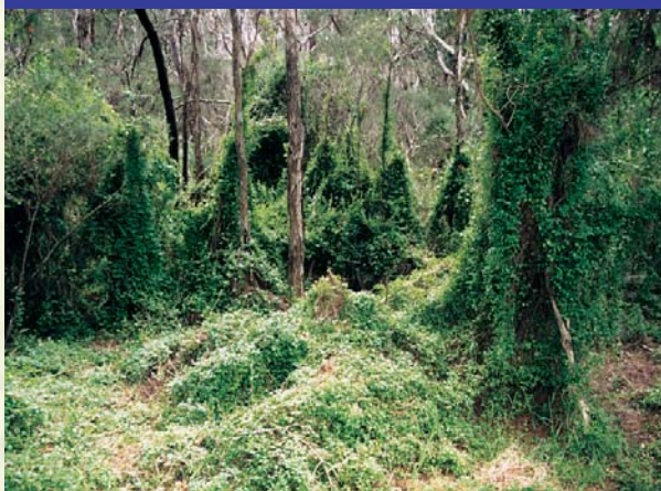
Bridal Creeper outcompeting indigenous woodlands at Newhaven Wetlands