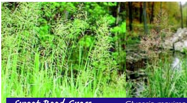
Sweet Reed Grass