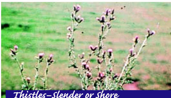
Thistles – Slender or Shore

Carduus pycnocephalus and C. tenuiflorus