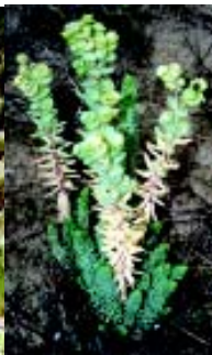
Spurge - Sea