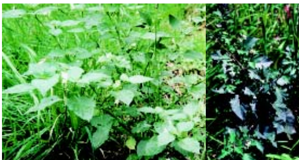
Blackberry Nightshade Solanum nigrum L.