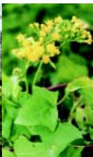
Ivy – Cape