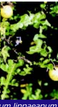
Apple of Sodom