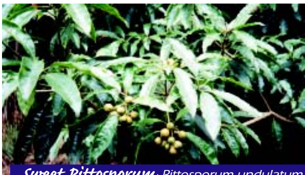
Sweet Pittosporum Pittosporum undulatum