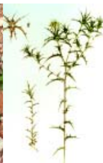
Thistles – Saffron