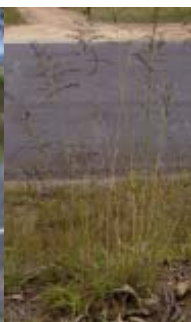
African Love Grass