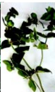
Spurge - Caper