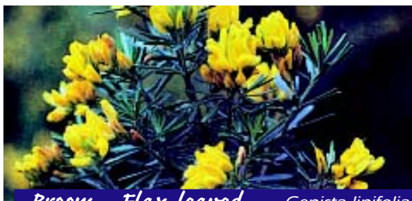
Broom – Flax-leaved