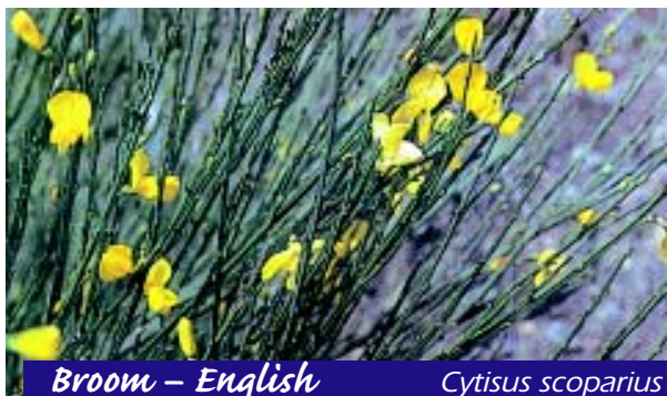
Broom – English