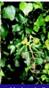
Ivy – English