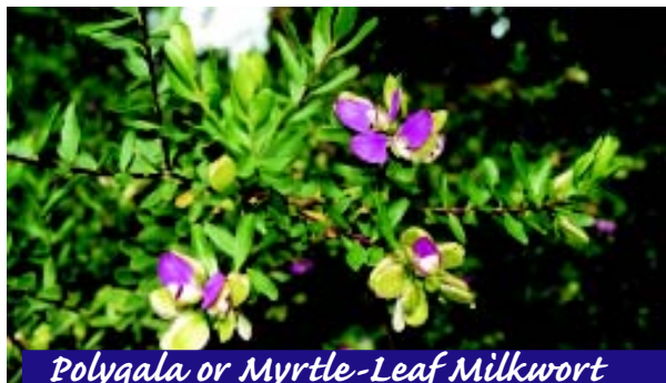
Polygala or Myrtle-Leaf Milkwort