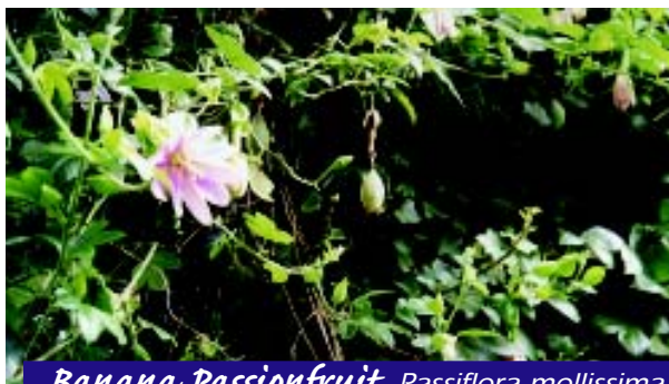
Banana Passionfruit Passiflora mollissima